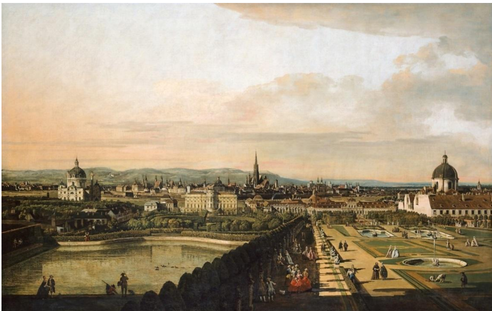
Vienna seen from the Belvedere, 1759-1760, by Bernardo Bellotto (Canaletto)