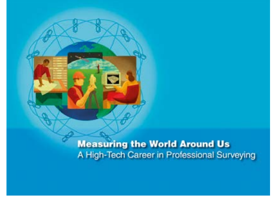
Fig. 3: The NCEES Surveying student recruitment PowerPoint presentation

presentation meant to allow survey practitioners and academics to enter secondary school classrooms and promote surveying as a career. Figure 3 shows the cover of the NCEES presentation.